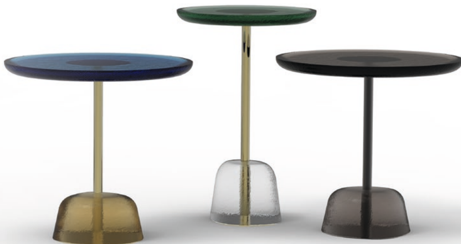
TABLE. DANCE. PARTY.

Sebastian Herkner's distinctively tall, skinny side table series pina is inspired by the abstract turns and twists of the famous Pina Bausch dance theatre. The basic figurine with base, rod and top shines in different combinations of aqua blue, transparent, green and light grey.